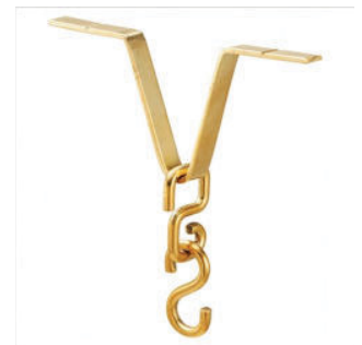
Gutter clip with rain chain hanger.

R ain chains can be simple or fancy. Several retail establishments sell copper rain chains. However, you can make a rain chain from almost anything. The materials only need to form a chain that can be attached to your gutter. Some ideas are keyrings, binder rings, lamp chains, tin cans, cookie cutters, rocks, and glass bottles. Be creative!