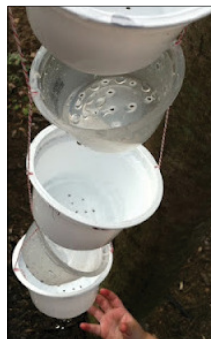
Rain chain made of yogurt containers!